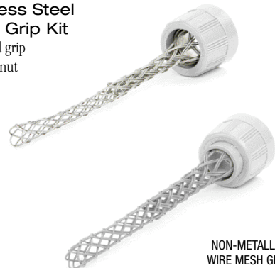
NON-METALLIC WIRE MESH GRIP